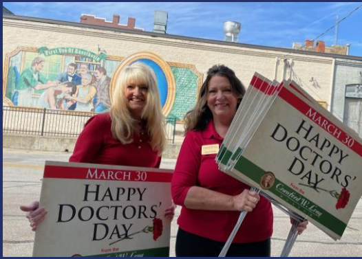
Delivering Doctor's Day signs