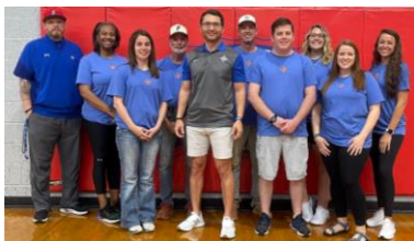
The Jefferson Parks & Recreation Crew

Jefferson Recreation provides leisure services for the citizens of Jefferson and surrounding areas. Jefferson Rec promotes healthy, active and enriching lifestyles by providing healthy activities for all ages.