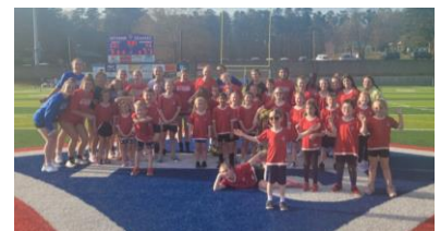
Soccer, Jefferson Rec Soccer Night at Memorial Stadium, March 30, 2022

With the warmer weather now upon us, more people are coming out of hibernation and taking part in all types of leisure programs, such as Silver Sneakers and Pickleball in the mornings, running and walking the trails, using the city's new playgrounds at the City Park and Hughey Park, participating in afternoon sporting events, and much more. Community members are out and about being active and it is wonderful!