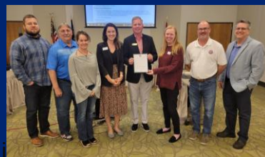
Proclaiming April Child Abuse Prevention Month