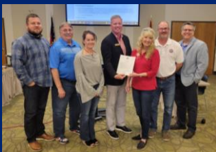
Proclaiming March 30 Doctors' Day Career Day