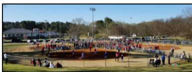
Tee ballers, ages 3-6, March 26, 2022

Spring sports season is in full swing. Opening Week brought out hundreds of people each afternoon. There wasn't a parking space empty with many parking wherever space was available.